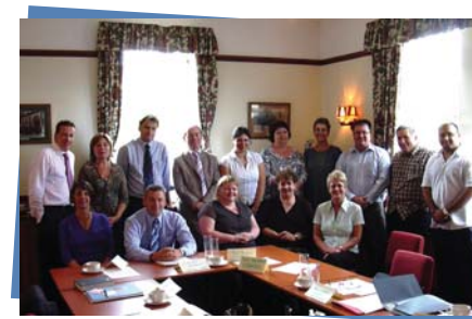
SCA Advisory Panel Meeting

They commented that the module was reaching many people who would not have been able to attend a face-to-face training session, either due to time or financial constraints and also reported that they were using the e-learning module as ' pre-training ' for individuals who were attending a classroom based programme.