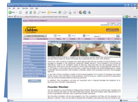
Screenshot from SCA portal

page of the material will include logos of each SCB . The learner will be able to click on the logo which will then take them to the appropriate page of their SCB's website, where their particular policies and procedures will be downloadable.