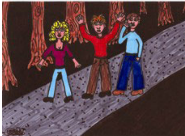
'Keeping Safe' by Kellie Craig - See next issue for 'Meet the Artist'